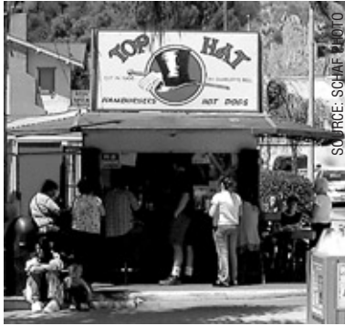
Top Hat, 299 East Main Street, Ventura.

Our City is currently gathering extraordinary talent to assist us with defining our growth through “Smart Growth”, “Form-based Code”, and “New Urbanism”. SBC is dedicated to working with the City in educating its growing membership in these new terminologies and how it affects the historic and cultural identity of San Buenaventura.