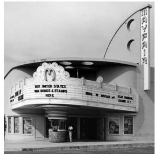
The Mayfair Theatre, 793 East Santa Clara Street, Ventura. The Mayfair was demolished on August 11, 2004.

San Buenaventura is fortunate that we currently have a City government in place that listens and responds to the voice of its citizens. The San Buenaventura Conservancy (SBC) was formed to be a conduit of the public voice for historic preservation advocacy. "Post Mayfair" developers have begun to put historic preservation concerns at the beginning of their planning process by soliciting the "opinion" of SBC in partnership with Historical Preservation Committee.